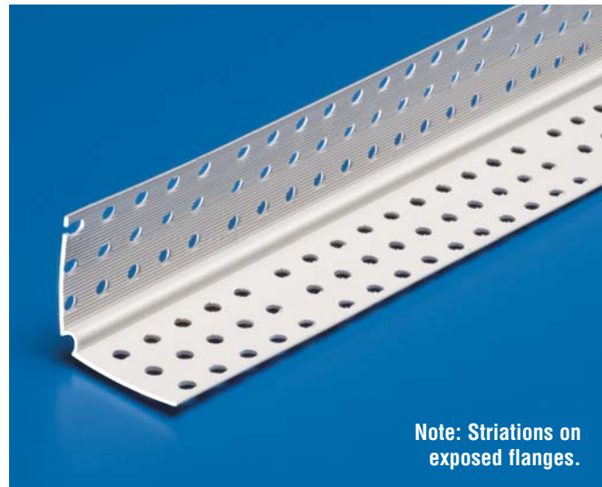
Note: Striations on exposed flanges.