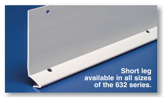
To order product with short leg, add suffix SL. Example: 632-50SL