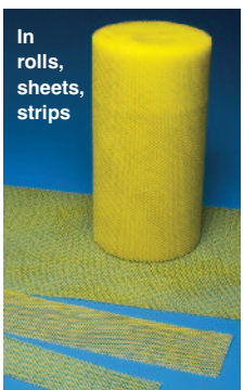
In rolls, sheets, strips