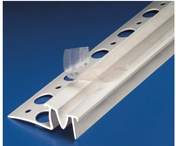
"F" Series also available. Add prefix "F" to the product number. e.g. Product F2150X

* For Stucco Trim, Ground dimension is measured from the back side of the flange to the top side of the trim piece.