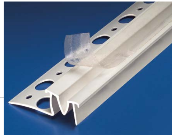
"F" Series also available. Add prefix "F" to the product number. e.g. Product F2150X