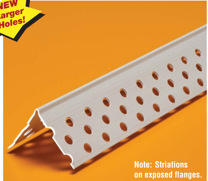
Note: Striations on exposed flanges.