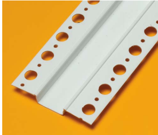
Aesthetic Channel Reveal

Exterior Channel Reveal will be Plastic Components, Inc. #_____. All exterior accessories shall meet ASTM standards D1784, C1063, C1861 and D4216, shall be third party tested and Canadian Code compliant. They shall be used where specified by the design authority and installed per industry standards.