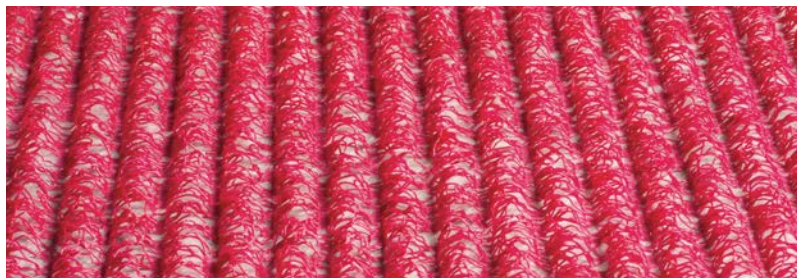
.40" (10 mm) Ultra Drain Mat

UDM-40 0.40" (10 mm) product meets the physical requirements of Section 9.27.2.2 Item 1B of the 2005 National Building Code of Canada and 2006 British Columbia Building Code.